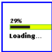
Yellow rectangular preloader

Read this tutorial and see how to create yellow rectangular preloader in flash 8. To create this tutorial you will also learn how to use Action Script code and apply it on the preloader.