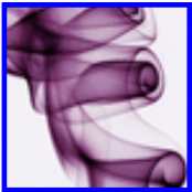
Vanishing text effect