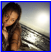
Little sunshine animation

This tutorial will show you how to create a little image presentation in flash. You can use this example whenever you want to present something.