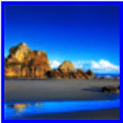
Image presentation in flash

In this lesson, you will see how to create vanishing text effect. You don't have to use action script code to make this lesson.