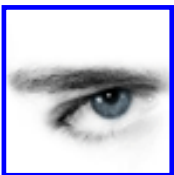
Vertical text effect

See how to create little sunshine animation in flash using a special picture and flash filters.