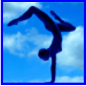
Attractive contour animation

Using this tutorial, you have a chance to learn how to make 3D title in flash using some special flash tips and tricks. You can use this tutorial when you have to create some 3D logo, text in flash.