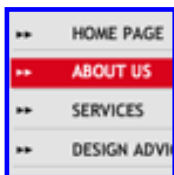
Red flash sound menu

See how to transform bitmap picture into a trace picture using the shape effect and Trace Bitmap options. You will also learn how to brake apart a picture and more.